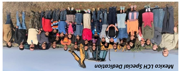
Mexico LCH Special Dedication

"Rescuing storm-tossed lives for Christ since 1978"